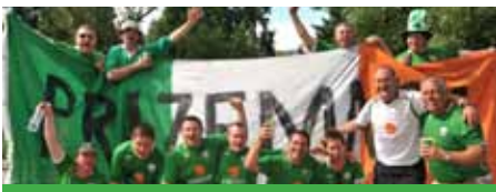
Irish Raiders win the Premiership