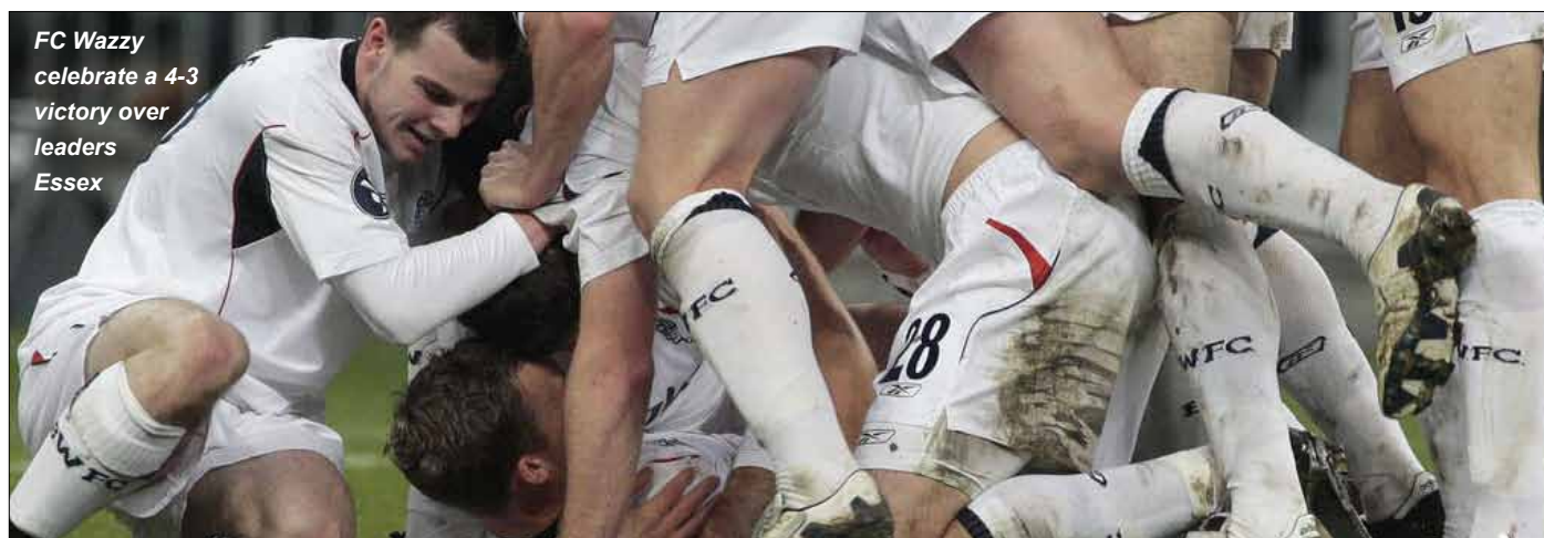
FC Wazzy celebrate a 4-3 victory over leaders Essex